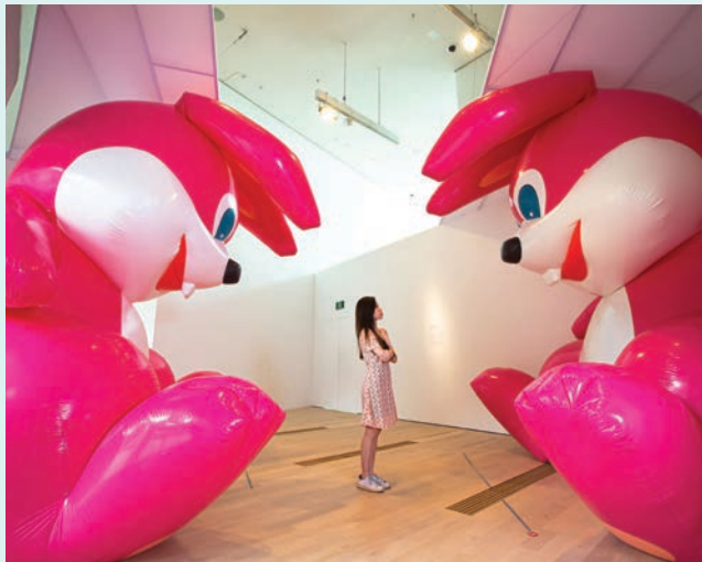
Somehow I Don't Feel Comfortable, Momoyo Torimitsu

Imagine alternative worlds through more than 40 objects and artworks, showcasing seven gigantic inflatables, which explore the long history of inflatable objects, their social functions and how they have changed the way we look at our world.