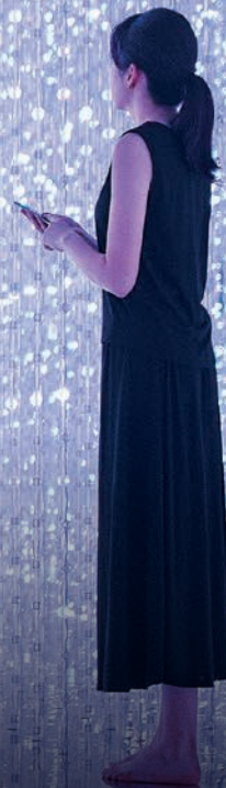
Crystal Universe, teamLab