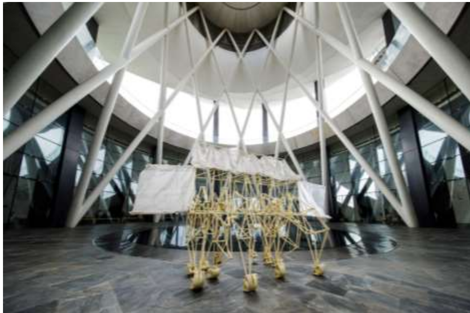
Animaris Ordis at ArtScience Museum