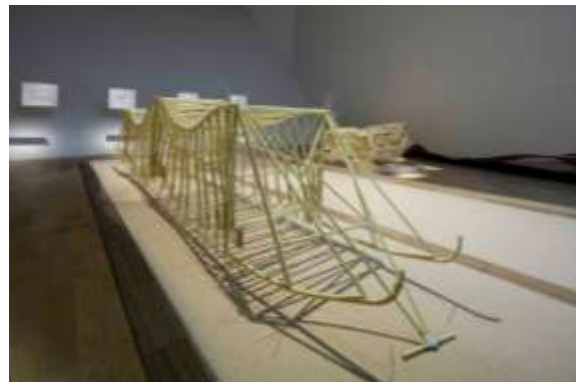
Animaris Burchus Primus at Wind Walkers

Also on show is the intriguing Animaris Burchus Primus , which bears an uncanny resemblance to a caterpillar. Unlike its predecessors, it is not wind-driven, but is instead pulled across the beach, or the gallery floor, by hand.