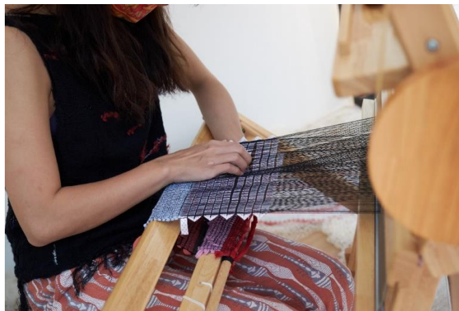
A community-driven weaving studio will be installed at Event Plaza to allow the public to create tapestries from upcycled fabric sourced from Marina Bay Sands

Paying homage to National Day festivities, the gourmet pop-ups will also feature local delights from RISE, Marina Bay Sands' buffet restaurant, as well as locally-inspired food and drinks from Black Tap and Yardbird.