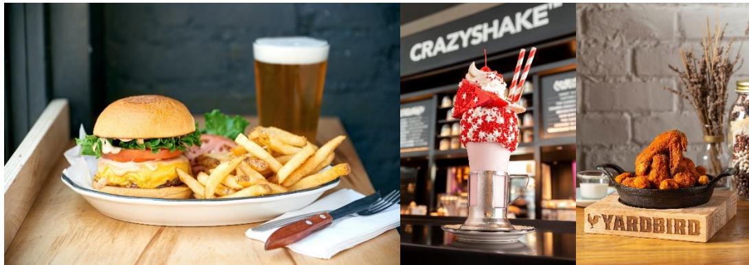
(From L to R): Look forward to Black Tap's classic All-American burger and Singapore-exclusive National Day CrazyShake® and a creative local fiery spin on the famous Yardbird chicken wings

Visitors can treat their tastebuds to a spectacular array of gourmet treats and beverages from three of Marina Bay Sands' signature restaurants throughout the Festival, specially priced for everyone to indulge and play a part for charity at the same time. In celebration of the Lion City's most treasured flavours, Black Tap Craft Burgers & Beer , RISE and Yardbird Southern Table & Bar will be presenting a creative spin on local favourites in addition to their all-time signature dishes.