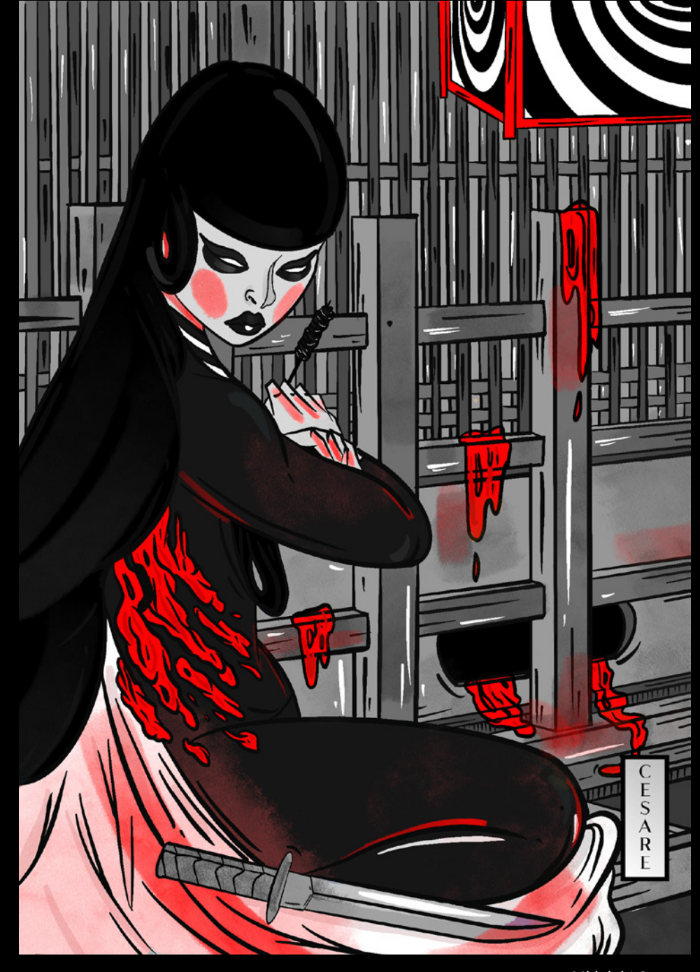
Midnight Supper Moon Malek