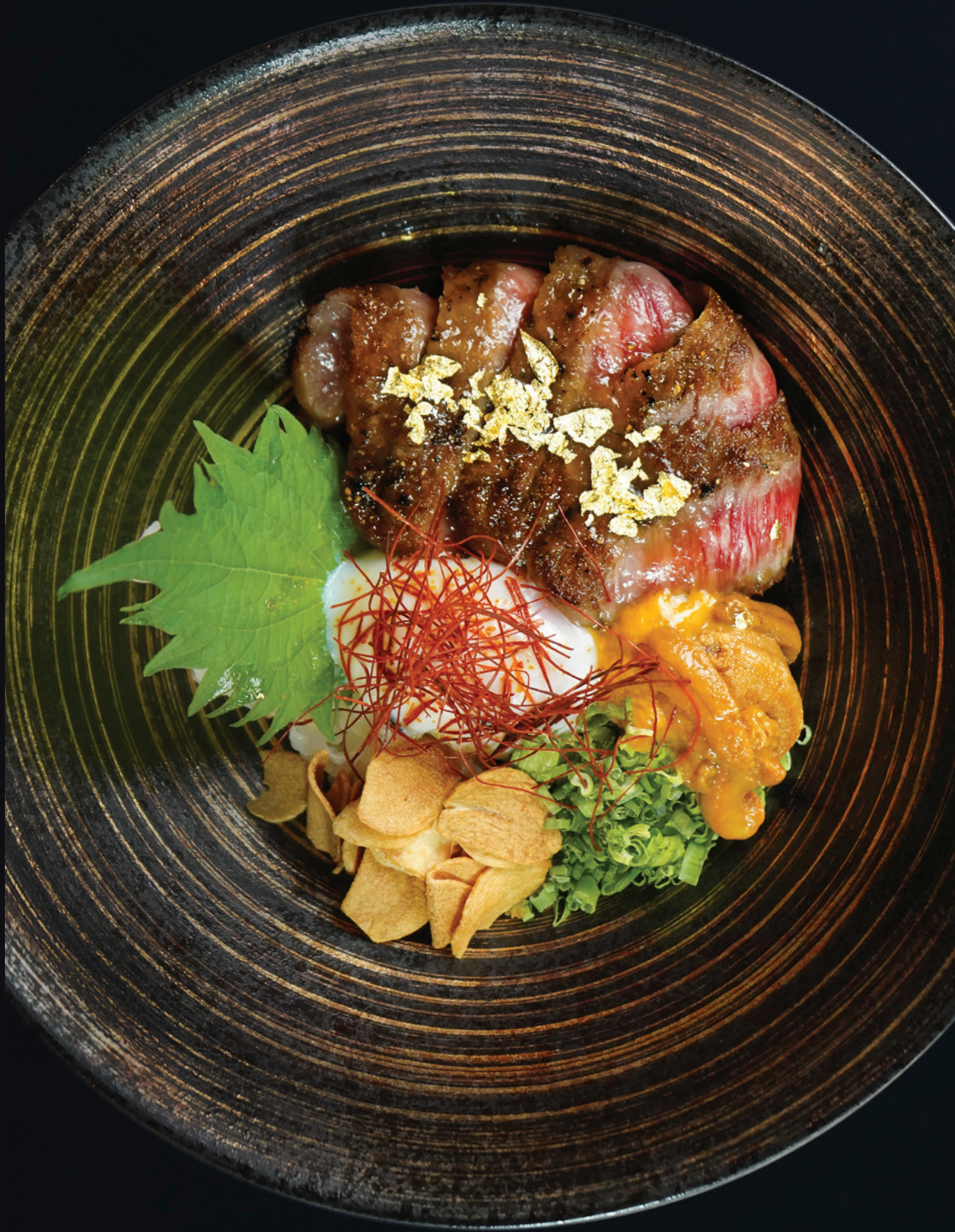
Mini Wagyu Don