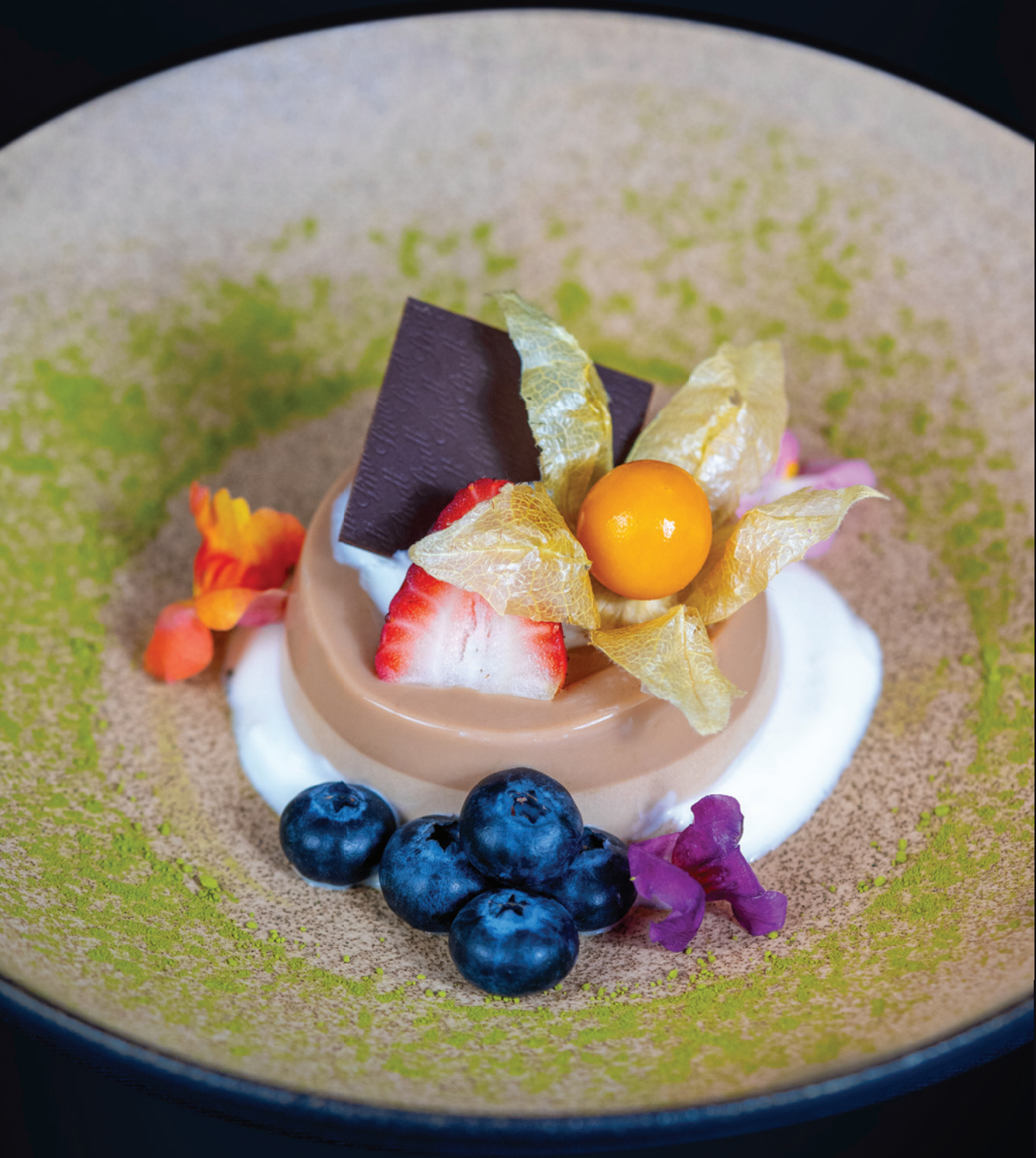
Earl Grey Panna Cotta