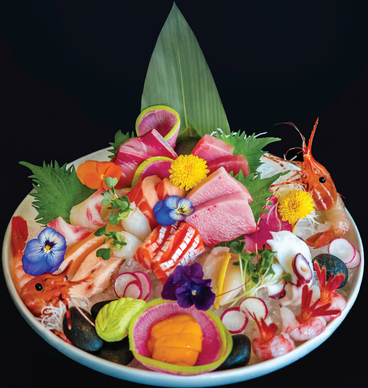
Chef's Omakase Sashimi Platter