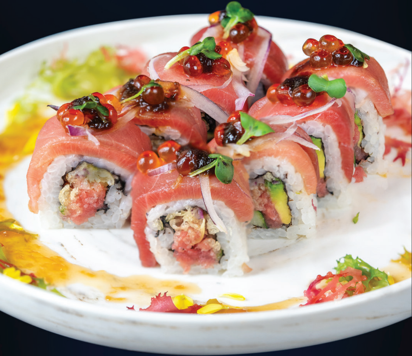
Maguro Madness Maki