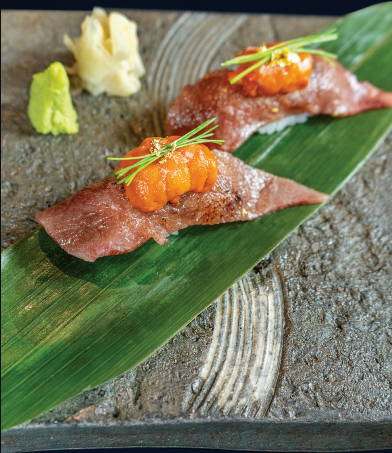
Wagyu Uni Nigiri