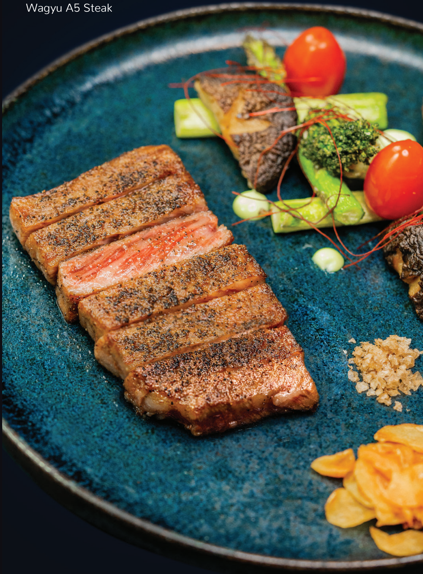
Wagyu A5 Steak