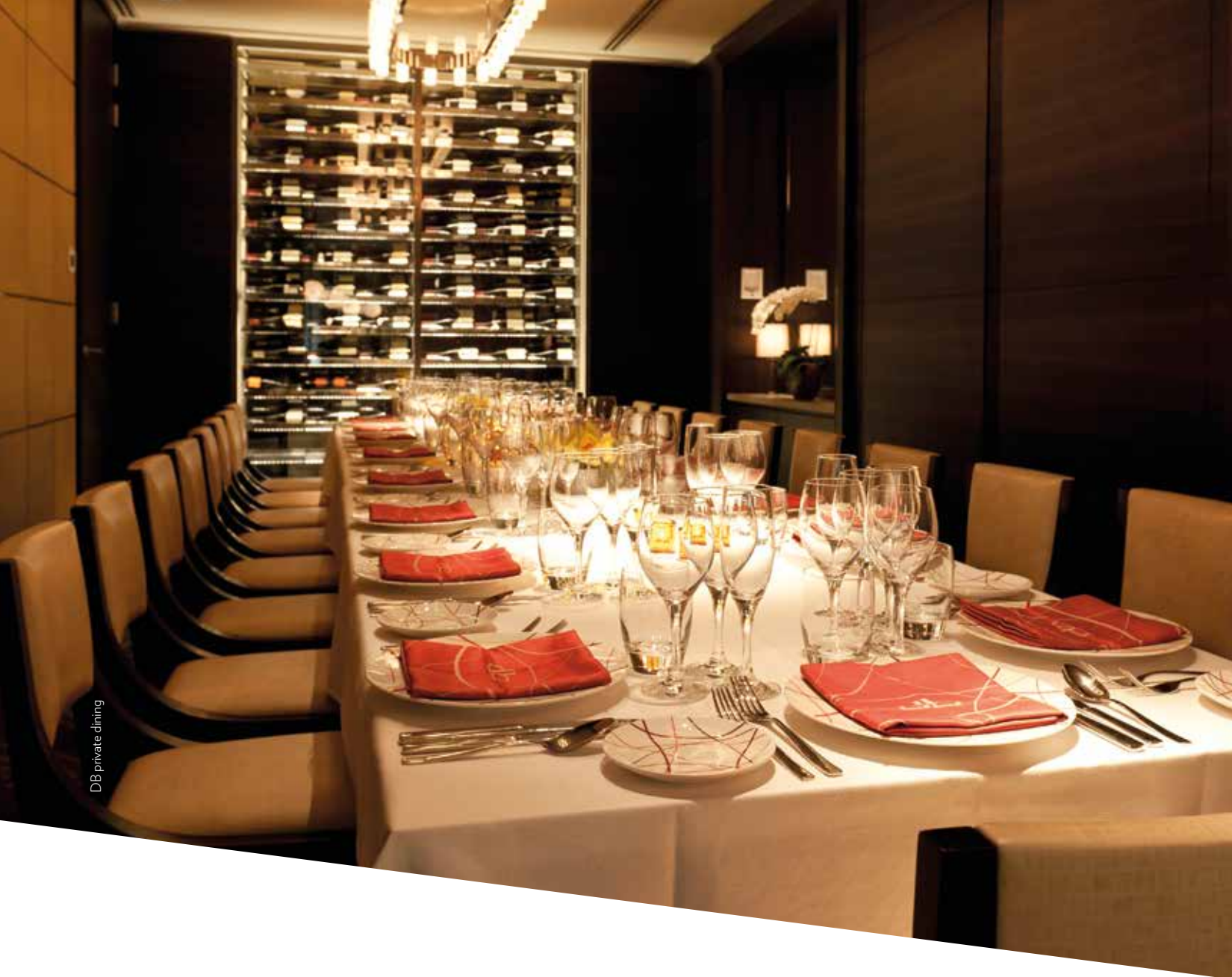
DB private dining